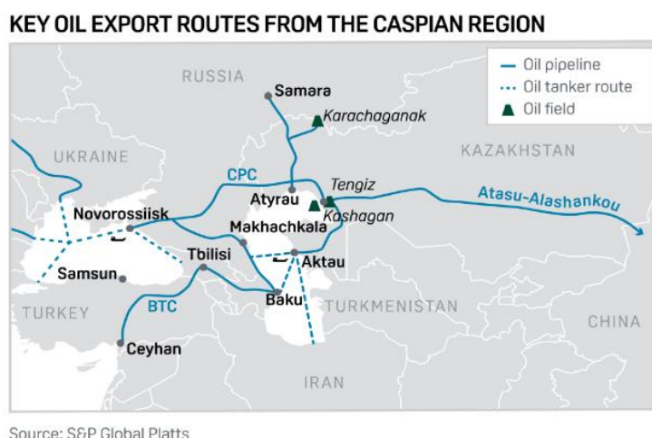
Figure 3. Key Oil Export Routes from the Caspian Region [5].

Diversification of export routes was recognised as an important goal after 1991 but was impeded by the geopolitical difficulties presented by many of the possible alternatives.” In their another manuscript [6], the same authors admitted that “Kazakhstan’s desire to diversify export routes and reduce its